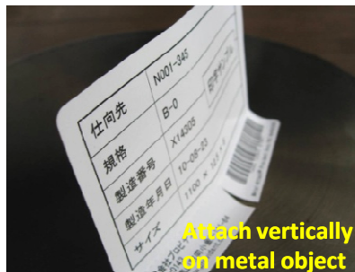
Attach vertically on metal object