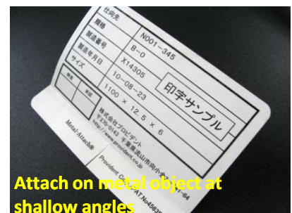
Attach on metal object at shallow angles